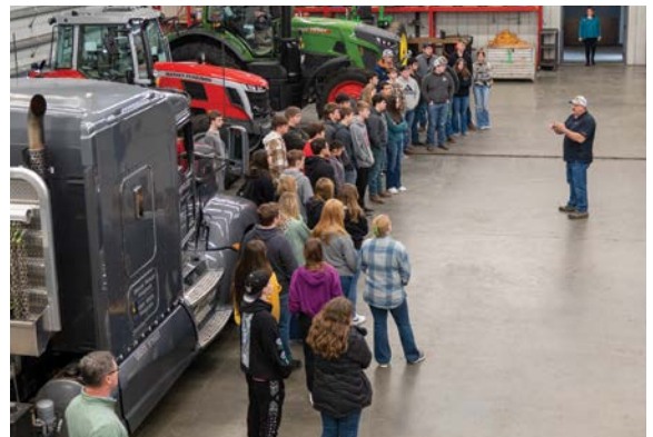
LOCAL HIGH SCHOOL STUDENTS LEARN ABOUT PARKLAND'S AG PROGRAM