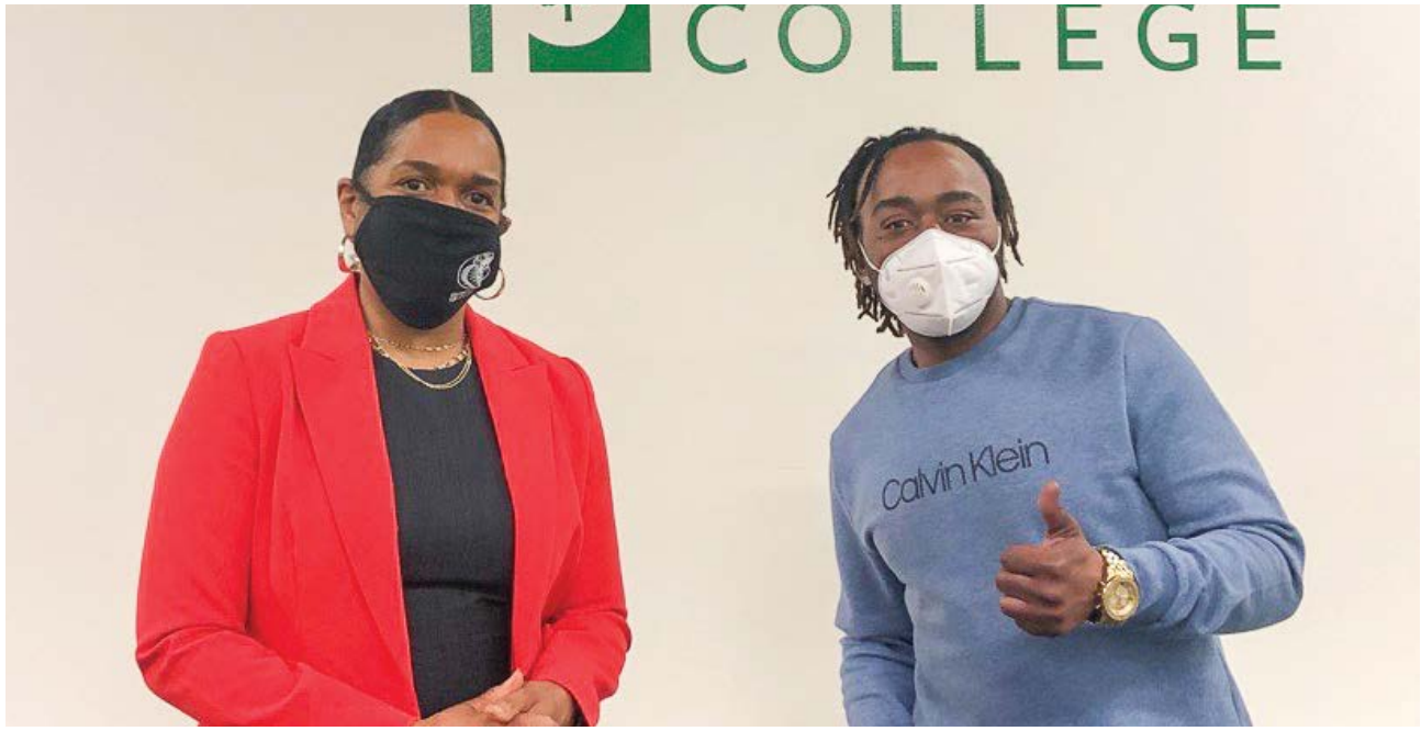
STATE LT. GOV. STRATTON AND GRAD WILLIE C. DISCUSS WORKFORCE EQUITY TRAINING AT PARKLAND IN MARCH.