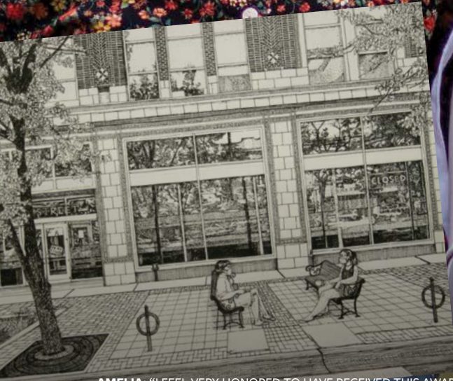
AMELIA: "I FEEL VERY HONORED TO HAVE RECEIVED THIS AWARD, BUT I AM JUST HAPPY TO BE ABLE TO PARTICIPATE IN THIS ART SHOW IN A YEAR WHERE WE HAVE BEEN ABLE TO DO SO LITTLE."